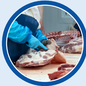
Procesamiento rech verduras/frutas/t'ij Limpieza xuquje ukolik productos Uq'otik xuquje esbal b'aq'il che ri t'ij