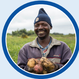
Chek' rech granja Xuquje rech ri tabaco