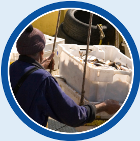
Kar/proceso rech kar