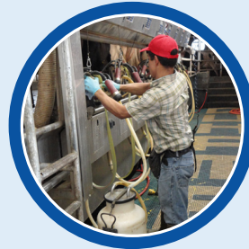
Industria rech ri lácteos